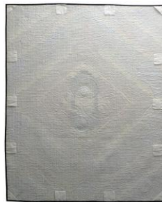
View of back of artwork