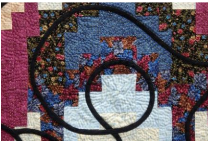
Detail image of artwork

The fracturing is no longer happening in an orderly fashion but becoming an undulating line. The black lines are hand applied using handmade bias tape. Dense hand stitching in three distinct patterns flowing from the center outward, enhance the piece and give it visual and physical texture resulting in interesting shadowing effects in various lighting conditions. This piece is designed to be displayed in either a vertical or horizontal orientation.